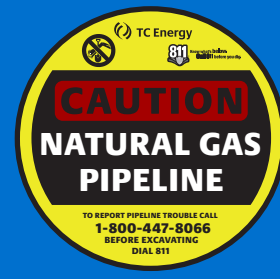
MARKER “SLAT” POST